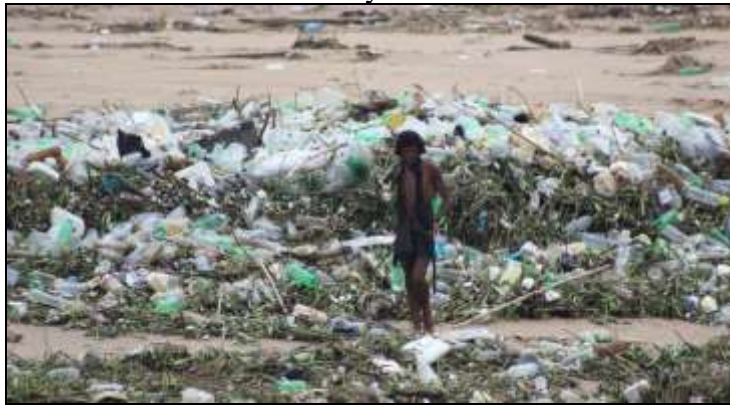
Figure 2: Beach litter on uMngeni Beach, Durban, following heavy rainfall into the uMngeni River in March 2019