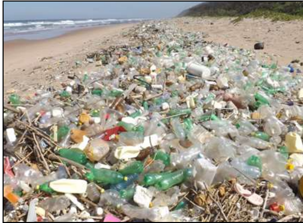
Figure 1: Beach litter on Cuttings Beach, Durban, following heavy rainfall into the uMlazi River in May 2016