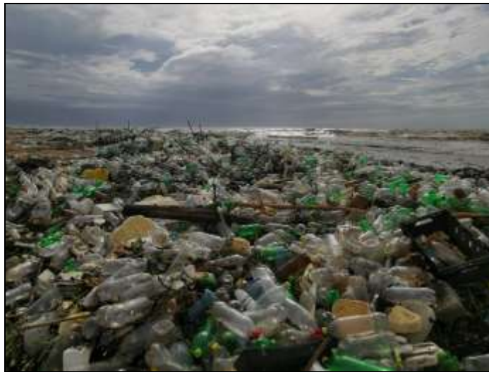
Figure 3: Land-based litter on uMngeni Beach, Durban, following heavy rainfall into the uMngeni River in March 2019

A common attribute of the priority river systems identified is that they are adjacent to human (often informal) settlements and industrial areas which generate domestic and industrial wastes (see Figure 4). Where such wastes are mismanaged or dumped, there is a high risk that it enters the rivers and eventually flows into the marine environment.