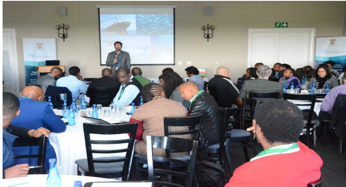
2016 MSP National stakeholder Summit